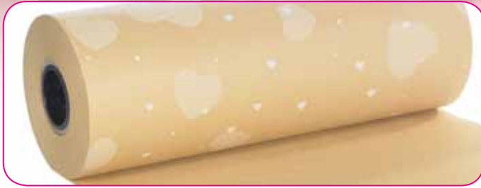
5K 224 HRT 833 ft 24" WHITE HEARTS KRAFT 5K 230 HRT 833 ft 30" WHITE HEARTS KRAFT