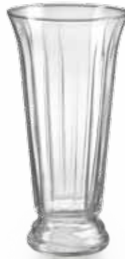
19 4176 12" COLUMN Opening: 6.5" case-6