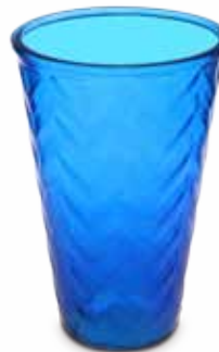
29 CB 387 K 10" COBALT HERO Opening: 6.1" case-6