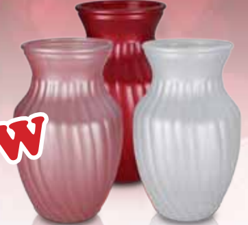
29 PV 499 8" PEARL LOVE JASMIN Opening: 3.5" case-12