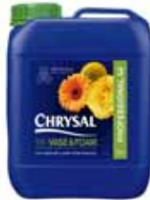
4P X 6503 PRO 3 5.5 gal