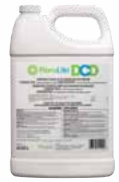
4L 3310 BUCKET CLEANER 1 gal