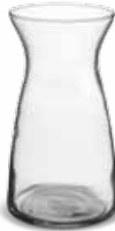
04 118 6-3/8" VIBE Opening: 3.0" case-12