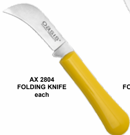
AX 2804 FOLDING KNIFE each