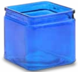
29 CB 505 5" COBALT WATER-CUBE Opening: 4.1" case-12