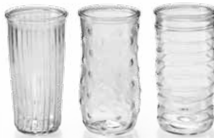
04 72 8.5" COMPO ASST Opening: 4.0" case-12