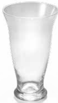
19 110 10" BUNDY Opening: 5.5" case-12