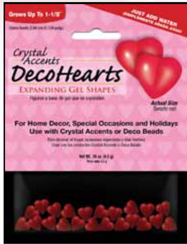
AX 18 DECO HEARTS 5 gram