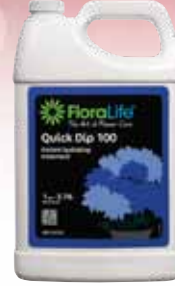
4P X 3783 QUICK DIP 1 gal