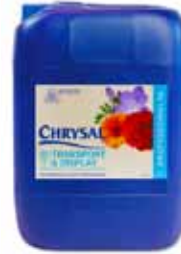
4P X 6502 PRO 2 5.5 gal