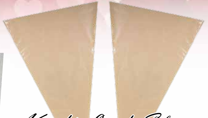
Kraft Look Sleeve

PV 130 1666 ft 30" 28-31mic PV 3030 1666 ft 30" 31-35mic PV 3530 1666 ft 30" 34-39mic