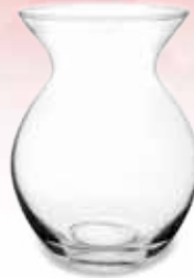
04 3028 6.5" LULITA VASE Opening: 4.2" case-12