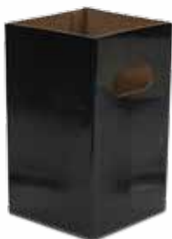
5W B 6610 6x6x10" BLACK BOX case-50