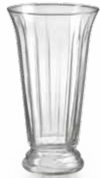
04 175 10.5" COLUMN Opening: 5.0" case-9