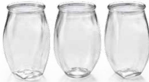
04 229 9" JUMBO TRIO Opening: 4.5" case-12