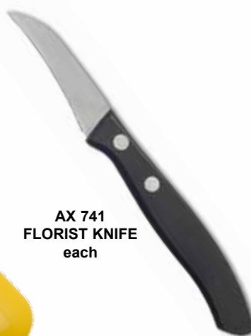
AX 741 FLORIST KNIFE each