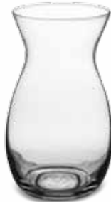
04 45 8" JORDAN Opening: 4.0" case-12