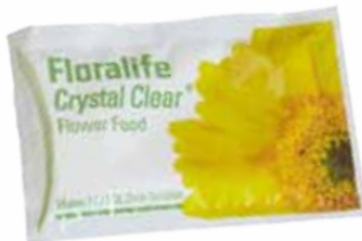
4P 3032 cs-1000 10 gram 4P 3037 cs-1000 5 gram 4P 3038 cs-2000 5 gram