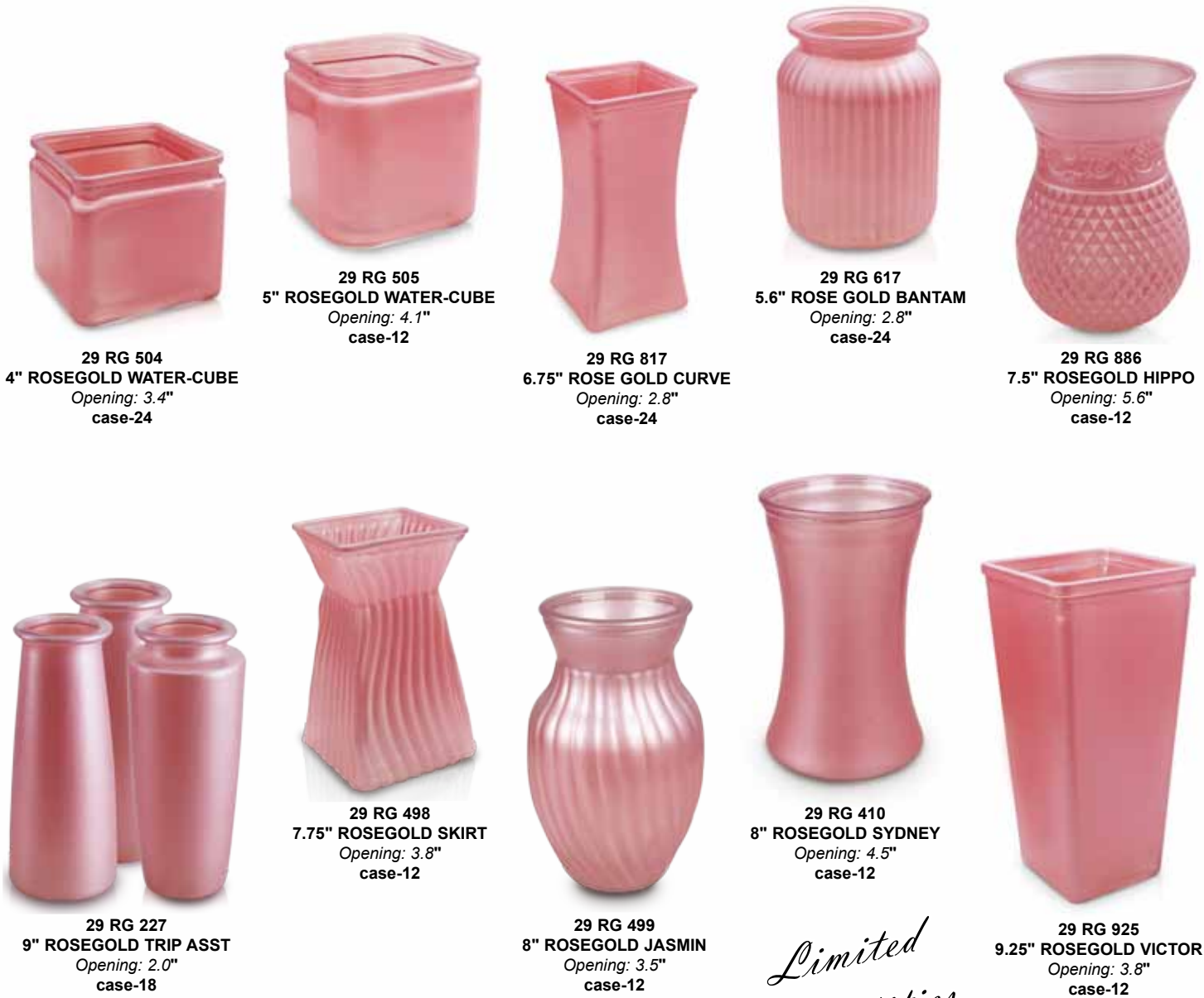
29 RG 504 4" ROSEGOLD WATER-CUBE Opening: 3.4" case-24