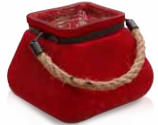
25 RR 575 4.5" RED ROPE INK JAR Opening: 2.9" case-12