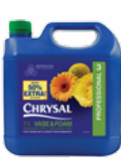
4L 1603 PRO 3 gallon