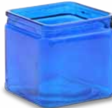
29 CB 504 4" COBALT WATER-CUBE Opening: 3.4" case-24