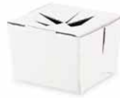
5W G 666 6x6x5" SNUGGY BOX case-100