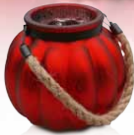
25 RR 107 E 6" RED ROPE PUMPY Opening: 3.2" case-12