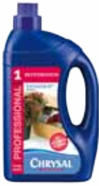
4L 101 X PRO 1 quart