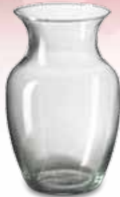
01 999 8" JARDIN VASE Opening: 4.0" case-24