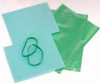
4Q 4803 ARRIVE ALIVE BIG BOUQUET case-100