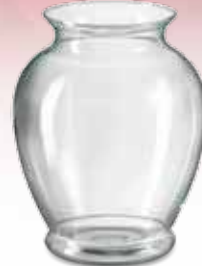
04 22 7" GINGER Opening: 4.0" case-9