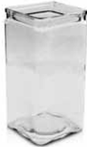
19 446 4x4x6" ECONOVASE Opening: 3.4" case-18