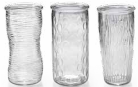
04 90 9-3/4" UTILITY ASST Opening: 4.5" case-12