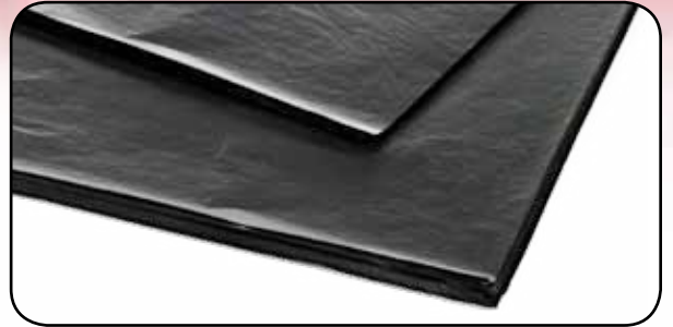
PT 4560 BK 18x24" BLACK BOUQUET TISSUE pkg-500