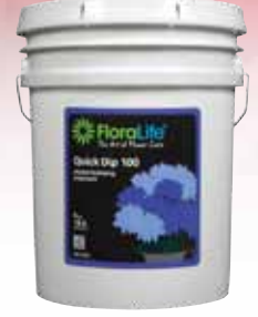
4P X 3780 QUICK DIP 5 gal