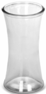
19 4104 8" ECONOVASE Opening: 3.6" case-12