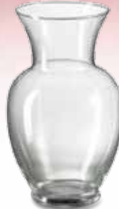
05 907 9" URN VASE Opening: 4.0" case-12