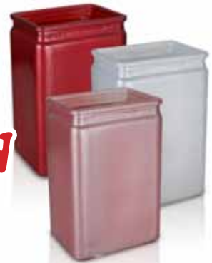
29 PV 436 4x3x6" PEARL LOVE ECONO RECT Opening: 3.4" case-18