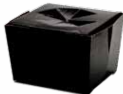
5W BG 664 6x6x4" BLACK SNUGGIE BOX case-50