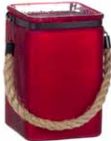
25 RR 446 E 6" RED ROPE ECONOVASE Opening: 3.4" case-12