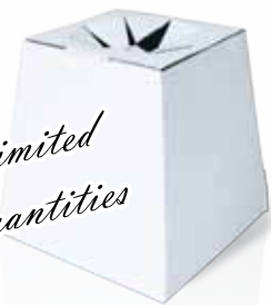
5W G 8811 8x8x11" VOLCANO BOX case-50