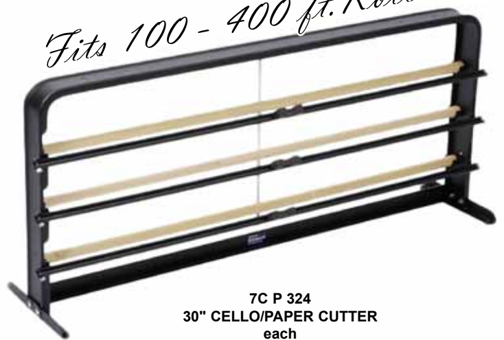
7C P 324 30" CELLO/PAPER CUTTER each