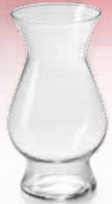
04 60 8.75" BELLA Opening: 4.5" case-12