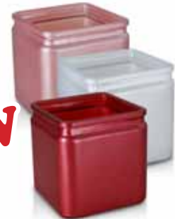
29 PV 504 4" PEARL LOVE CUBE Opening: 3.4" case-24