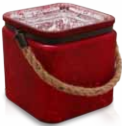
25 RR 404 E 4" RED ROPE ECONOCUBE Opening: 3.4" case-12