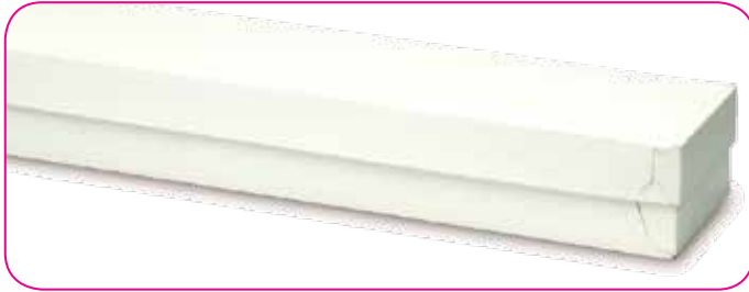
5X W 3064 30x6x4" WHITE BOX case-50