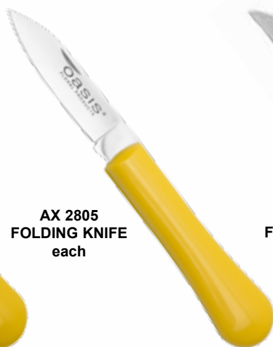
AX 2805 FOLDING KNIFE each