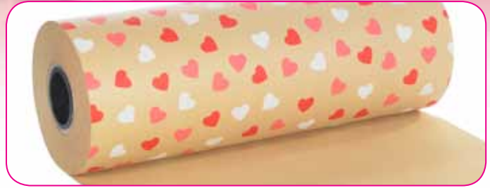
5K 224 VL 833 ft 24" ASST HEARTS KRAFT 5K 230 VL 833 ft 30" ASST HEARTS KRAFT