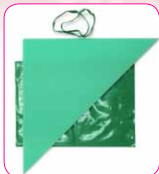
4Q 4801 ARRIVE ALIVE TRIANGLE case-100