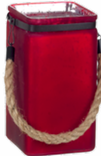
25 RR 448 E 8" RED ROPE ECONOVASE Opening: 3.4" case-12