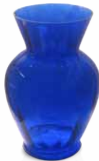
29 CB 905 10.5" COBALT GARDEN URN Opening: 5.0" case-6