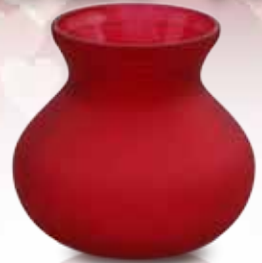
29 FRD 331 6" FROST-RED POSIE Opening: 3.4" case-12