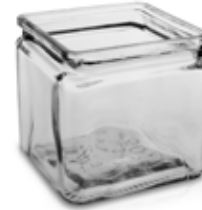
17 W 504 4" WATER-CUBE Opening: 3.4" case-24