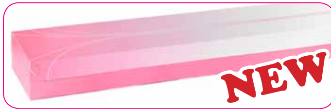
5Z P 3564 bdl-50 35x6x4" PINK ROSEBOX