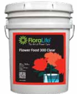
4P 3065 500 quart 10 lbs 4P X 3050 1500 quart 30 lbs