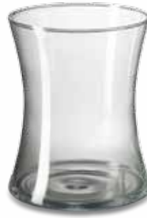
19 4111 8x6" SYDNEY VASE Opening: 5.4" case-9