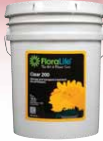
4L 3130 PRO 5 gal