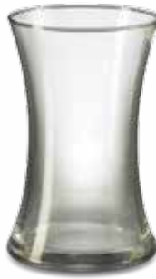
04 110 8x5" SYDNEY VASE Opening: 4.5" case-9