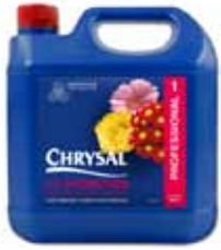
4L 1601 X PRO 1 gallon