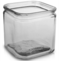
17 W 505 5" WATER-CUBE Opening: 3.4" case-12