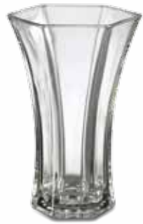
04 41 X 10" FLARED VASE Opening: 6.3" case-6