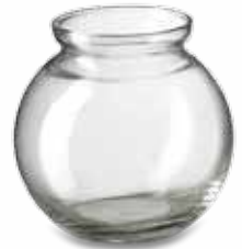
03 354 4x4.2" RIM BALL Opening: 2.5" case-48