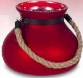
25 RR 331 E 6" RED ROPE POSIE Opening: 3.4" case-12