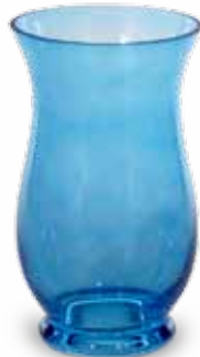
29 CB 265 10.5" COBALT MARTY Opening: 5.5" case-6