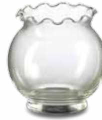
03 355 5x5.2" IVY BALL Opening: 3.0" case-36