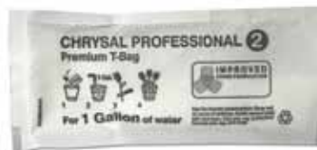
4P 1320 case-320 (1 gallon/3.7 litre) 4P X 1600 case-600 (1.5 quart/1.4 litre) 4P X 1920 case-920 (1 gallon/3.7 litre)