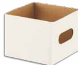
5W 666 6x6x6" WHITE BOX case-100