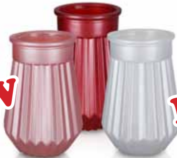
29 PV 807 6.5" PEARL LOVE STEPHY ASST Opening: 3.0" case-24