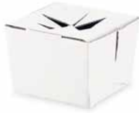
5W G 996 9x9x6" SNUGGY BOX case-100