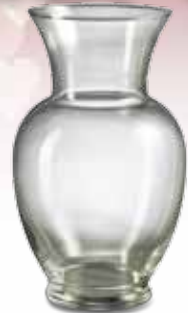
05 912 10.5" URN VASE Opening: 5.0" case-12