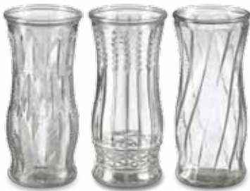
05 972 8.5" UTILITY ASST Opening: 4.0" case-12