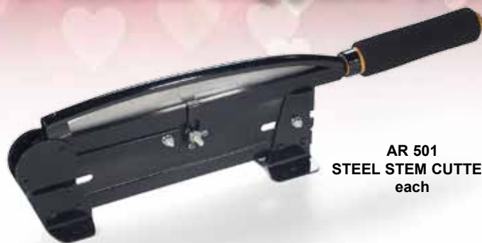
AR 501 STEEL STEM CUTTER each