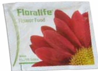
AL 3002 bx-200 5 gram 4P 3005 X cs-1000 5 gram 4P X 3008 cs-2000 5 gram