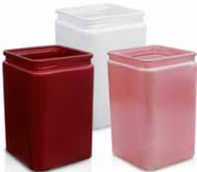
29 PV 446 4x4x6" PEARL LOVE ECONOVASE Opening: 3.4" case-18