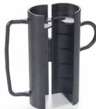
AR 953 DAMAGE FREE STRIPPER each