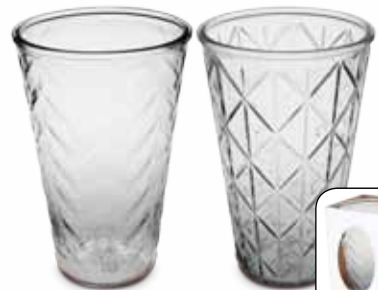
19 387 K 10" HERO VASE Opening: 6.1" case-6