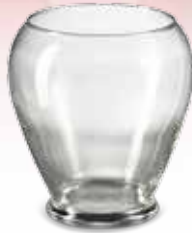
04 114 5.75" BOUQUET Opening: 4.2" case-12