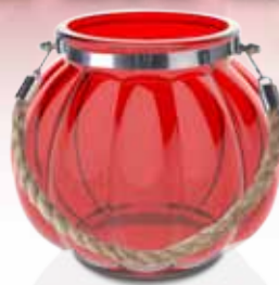
24 RR 107 6" RED PUMPY ROPE VASE Opening: 3.2" case-12