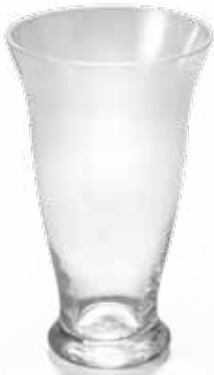
19 112 12" BUNDY Opening: 6.5" case-6