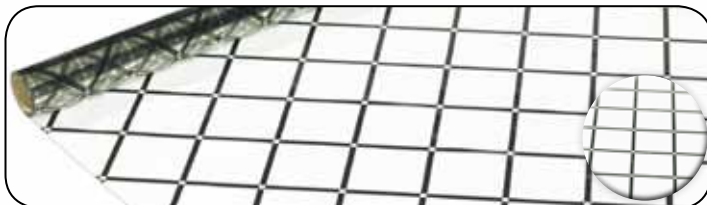
PWP 30 LT 100 ft 30" BLACK LATTICE CELLO