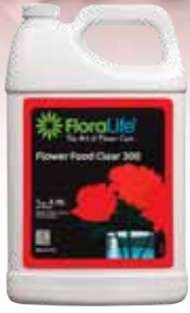
4P X 3170 CRYSTAL CLEAR 1 gal