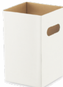
5W 7710 7x7x10" WHITE BOX case-100