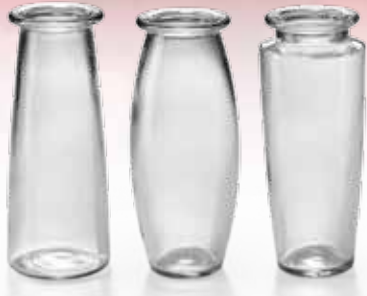
19 4227 9" TRIP ASSORTMENT Opening: 2.0" case-18