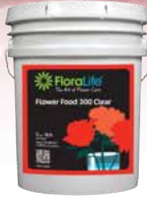
4P X 3288 CLEAR 1.6 5 gal