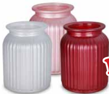
29 PV 617 5.6" PEARL LOVE BANTAM ASST Opening: 2.8" case-24