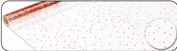
PWP 30 RD 100 ft 30" RED POLKA CELLO