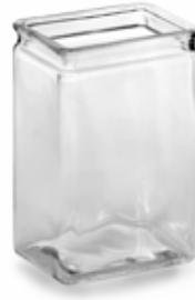
19 436 4x3x6" ECONO RECT Opening: 3.4" case-18