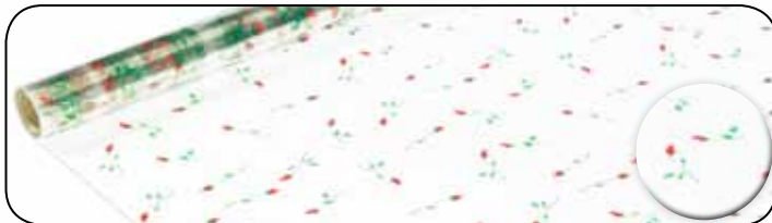
PWP 30 RS 100 ft 30" ROSEBUD CELLO