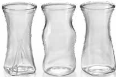
04 93 8.5" UTILITY ASST Opening: 4.2" case-12