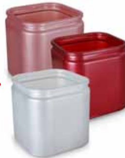
29 PV 505 5" PEARL LOVE CUBE Opening: 4.1" case-12