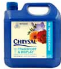
4L 1602 PRO 2 gallon