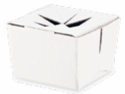
5W G 664 6x6x4" SNUGGY BOX case-100